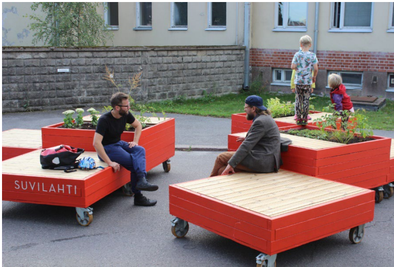
Modular Seating (concept)