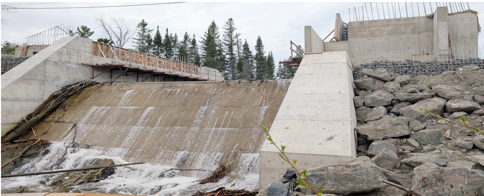
County Structure C201 (Broomes Creek Culvert and Dam), Township of Whitewater Region

For the safety of all, please use extra caution when travelling through construction zones.